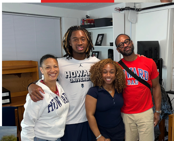
The Van Sipmas still thriving in Homewood!