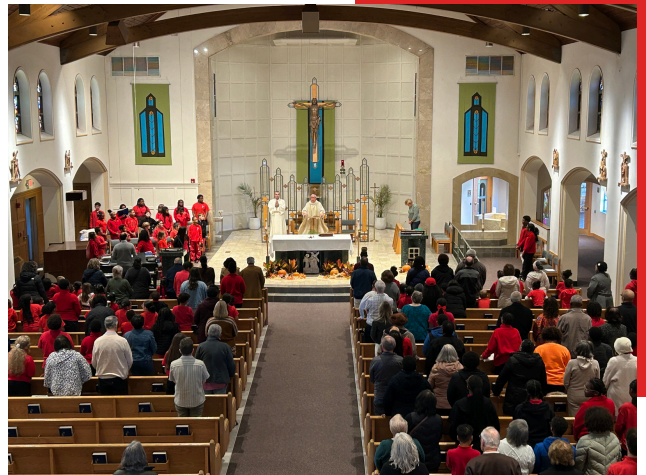
Grandparents visit classrooms and attend Mass on Grandparents Day '25!