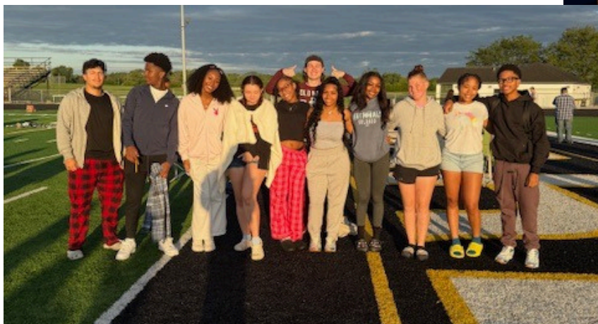
Marian '25 seniors celebrating Senior Sunrise!