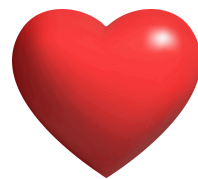
Muffins with Moms on the Feast of the Immaculate Conception of Mary December 8, 2025!